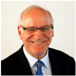
Gil Paterson Scottish National Party