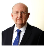
Convener Bill Bowman Scottish Conservative and Unionist Party