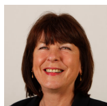
Mary Fee Scottish Labour