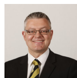
Deputy Convener Stuart McMillan Scottish National Party