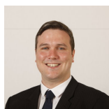
Tom Arthur Scottish National Party