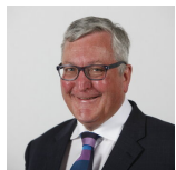
Fergus Ewing Independent