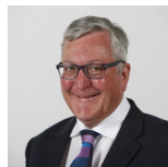
Fergus Ewing Independent