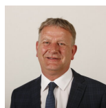
Deputy Convener David Torrance Scottish National Party