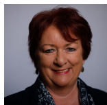
Rona Mackay Scottish National Party