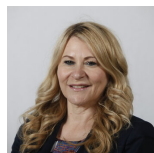
Pauline McNeill Scottish Labour