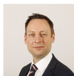
Deputy Convener Liam Kerr Scottish Conservative and Unionist Party