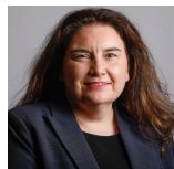
Katy Clark Scottish Labour