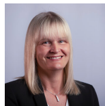
Sharon Dowey Scottish Conservative and Unionist Party