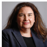
Katy Clark Scottish Labour