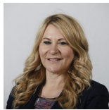
Pauline McNeill Scottish Labour