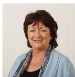
Rona Mackay Scottish National Party