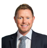
Jamie Greene Scottish Conservative and Unionist Party