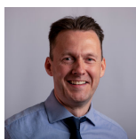
Deputy Convener Russell Findlay Scottish Conservative and Unionist Party