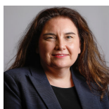
Katy Clark Scottish Labour