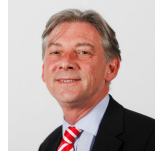
Richard Leonard Scottish Labour