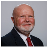
Colin Beattie Scottish National Party