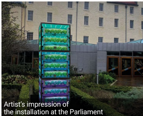
Artist's impression of the installation at the Parliament

The Cubes of Perpetual Light in partnership with Dandelion, is an installation centred on sustainability and the concept of sow, grow and share as applied to music, community, food, ideas and knowledge. The Cubes combine miniature vertical farms with LED lighting and specially commissioned music, to encourage plant growth.