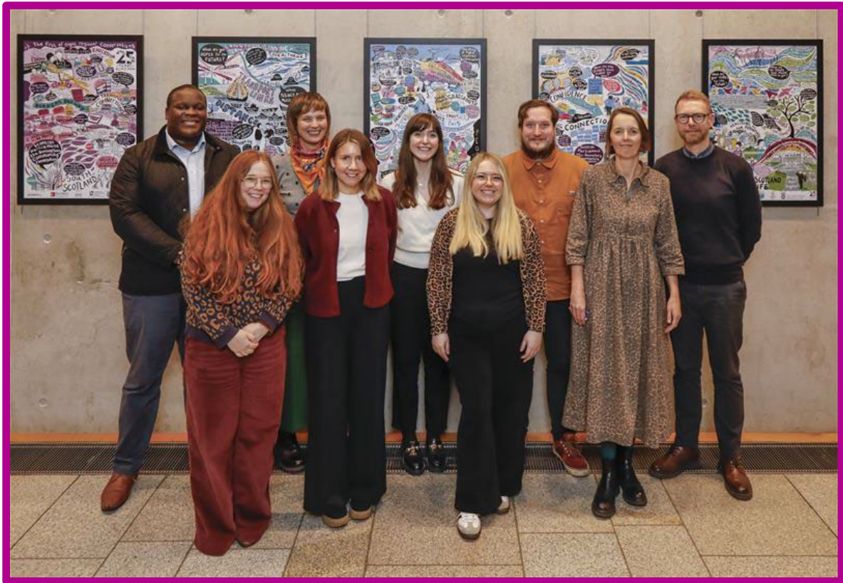
The Participation and Communities Team (PACT)

At the time of writing, 29 of the 32 planned visits had been completed, with the remaining three due over the Summer of 2026.