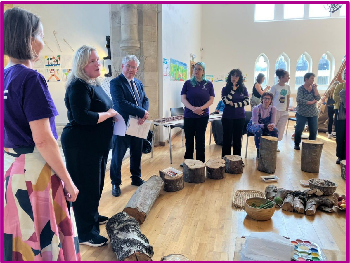
Your Community Your Voice, Community Celebration The Barony Centre, West Kilbride, 21 March 2026

The themes are not presented in order of priority. They reflect recurring issues raised across Scotland at a particular point in time.