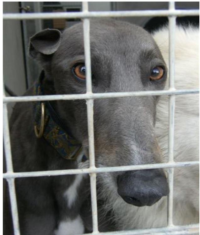
A racing greyhound in Ireland.