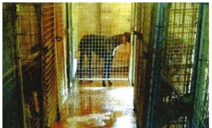
A greyhound in an Australian kennel.

Kennels vary widely across jurisdictions. In Macau, the greyhound kennel compounds were fifty-year-old sparse concrete structures with metal bars or fencing to contain the dogs, two-thirds of which “would fail to meet the minimum size for a racing kennel in Australia.” 19 In the US, there are two standard cage sizes, 49”-36”-35” and 43”-30”-32”. The latter is barely large enough for some greyhounds to stand up or turn around. 20