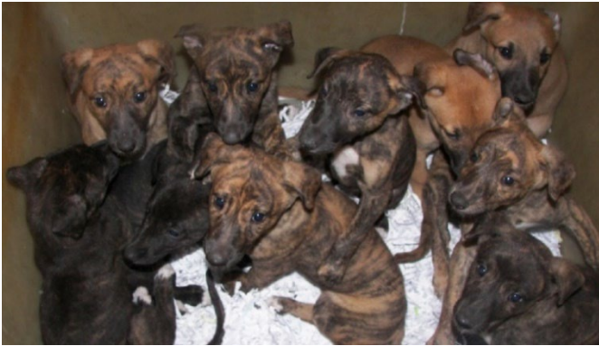
Puppies from a breeding farm in the United States.

Australia reported 3,006 litters in 2015. 11 Using the conservative estimate of six pups per litter, the industry bred approximately 18,036 greyhounds that year. In 2015 only 11,732 were registered to race, a discrepancy of 6,304 dogs. 12