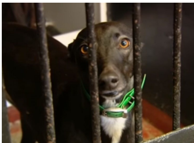
A caged racing greyhound in Ireland.

Commercial greyhound racing exists in seven countries at 115 tracks worldwide. 1 First invented in the United States, commercial racing is typically characterized by a regulating authority, state-sanctioned gambling, an industrialized breeding apparatus, a greyhound tattoo identification system, organized kennel operations, and a network of public racetracks.