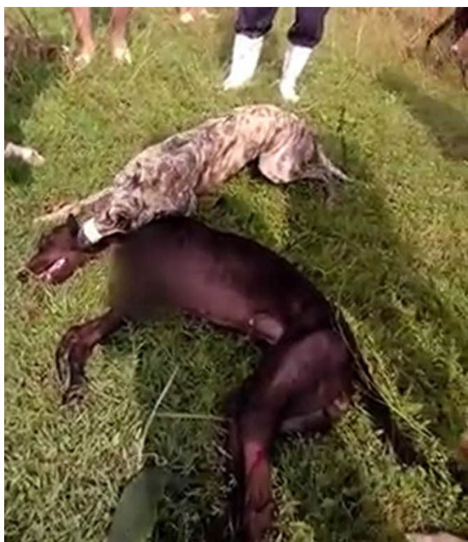
Dogs poisoned to death after racing in Vietnam.

Since GREY2K USA Worldwide began its US campaign in 2001, forty-four American dog tracks have closed or ceased live racing. 107 Most recently, Oregon became the forty-second state to outlaw dog racing outright.