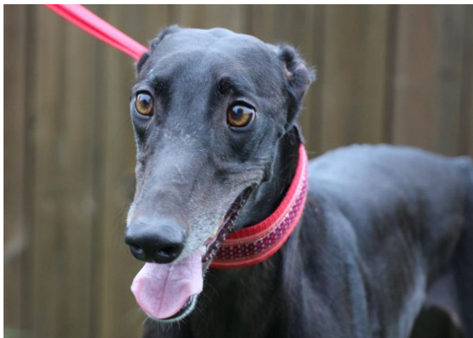
Kiowa Amage Me tested positive for cocaine in the United States in 2015.

Five racing countries have regulatory frameworks in place to handle drug screening — the US, Australia, Ireland, New Zealand, the UK. 77 These industry organizations are responsible for finding and handling drug violations.