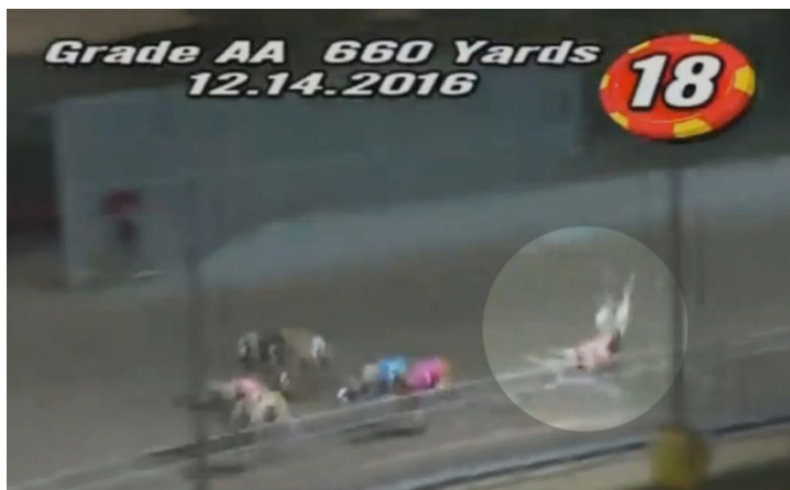
A dog falls at a race track in the United States.

jurisdictions regularly publish injury data. The racing commissions of the American states of Arkansas, Iowa, and West Virginia produce injury data subject to public request, and the Australian state of New South Wales started publishing injury data in late 2015. Reported injuries include broken legs, crushed skulls, seizures, paralysis, broken backs, and death by electrocution.