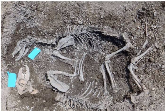
Greyhound skeletons in a mass grave in Australia.

In New South Wales, Australia, a 2016 Parliamentary investigation revealed evidence that suggests as many as 68,448 greyhounds had been killed over a twelve-year period because “they were considered too slow to pay their way or were unsuitable for racing.” 30 A few days after this analysis was released, a greyhound mass grave was discovered at the Keinbah Trial Track near Cessnock. 31 Almost 100 greyhounds had been killed there “with a blow to the head, from either a gunshot or a blunt instrument.” 32