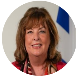
Fiona Hyslop MSP

For decades now, we have all experienced the benefits that car use can provide – now we need to agree collectively and as a nation, that there can be benefits from reducing our car use. We must work together, as national and local government, to realise them.