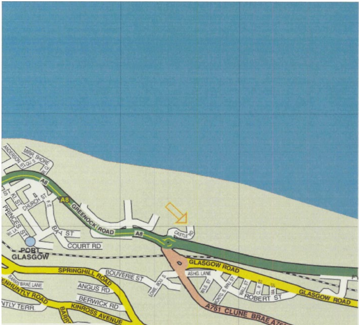
Ferguson Marine Engineering Ltd (FMEL), Newark Works, Port Glasgow, Scotland, PA14 5NG