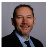
Douglas Lumsden Scottish Conservative and Unionist Party