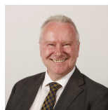
Alex Neil Scottish National Party