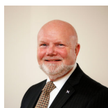
Colin Beattie Scottish National Party