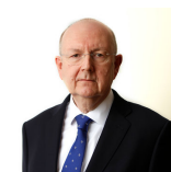
Bill Bowman Scottish Conservative and Unionist Party