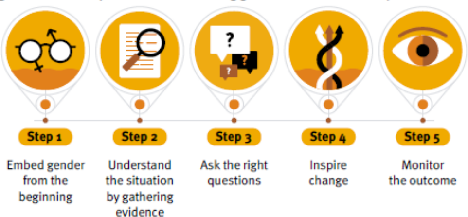
Figure 1. A five-step model for conducting gender-sensitive scrutiny